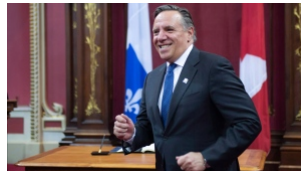
Legault promises change as he becomes premier, announces cabinet

Montreal mayor will need to work with new CAQ minister, her former political foe